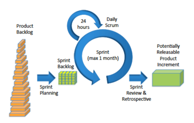
Figure 1: Diagram of the Scrum methodology

In this section we will detail what steps will be followed for the development of the mobile application, so we will use the Agile Scrum Methodology as shown in Figure 1 which explains in a general way the behavior of Scrum, using this methodology is advantageous due to the flexibility in the requirements and ease in adapting to changes.